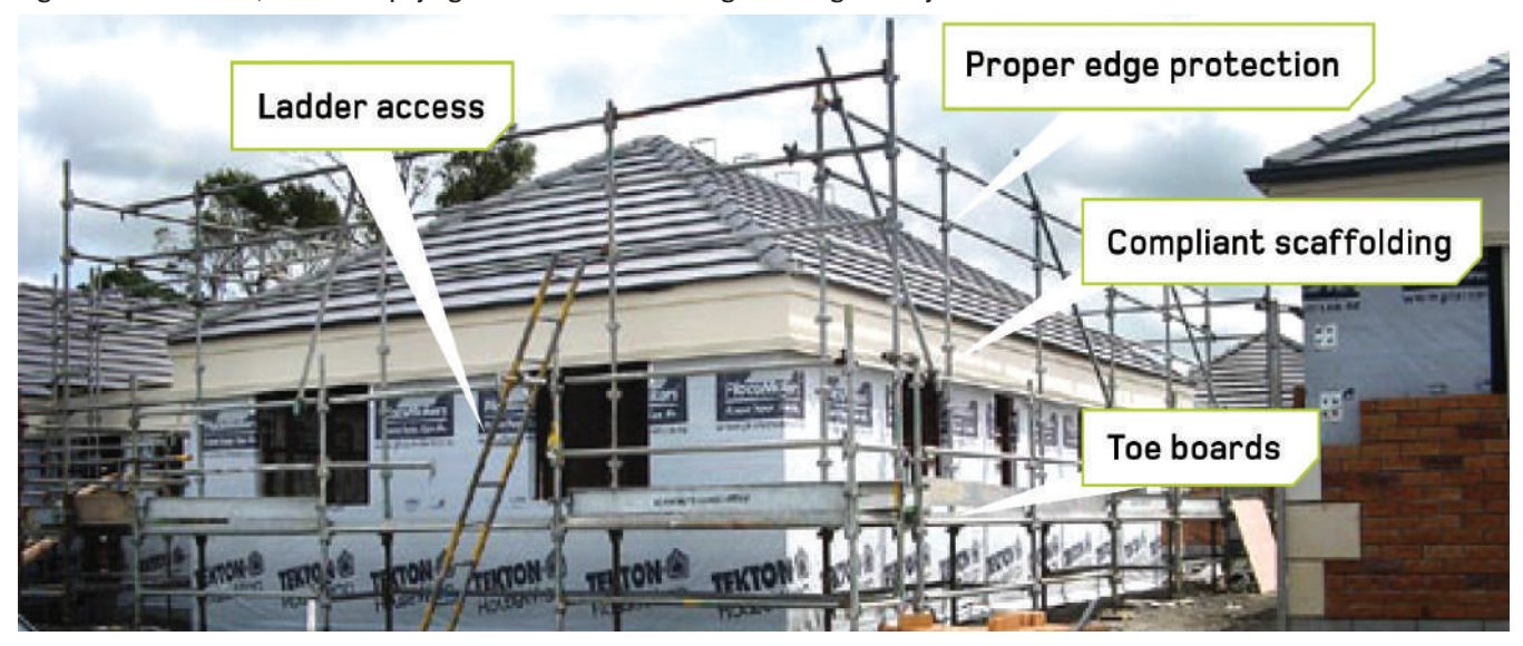
Figure 2: Nice to have, but who is paying - Illustrative scaffolding for a single-storey residence